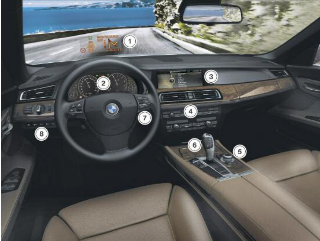
Display, operating and control concept BMW 7 Series F01/F02

With the new BMW 7 Series F01/F02, a new operating and control concept is being introduced at BMW. In addition to the main menu, there is an arrangement of four direct access buttons, a Back button and an Option button in the immediate vicinity of the controller.